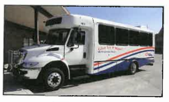
August 31, 2020